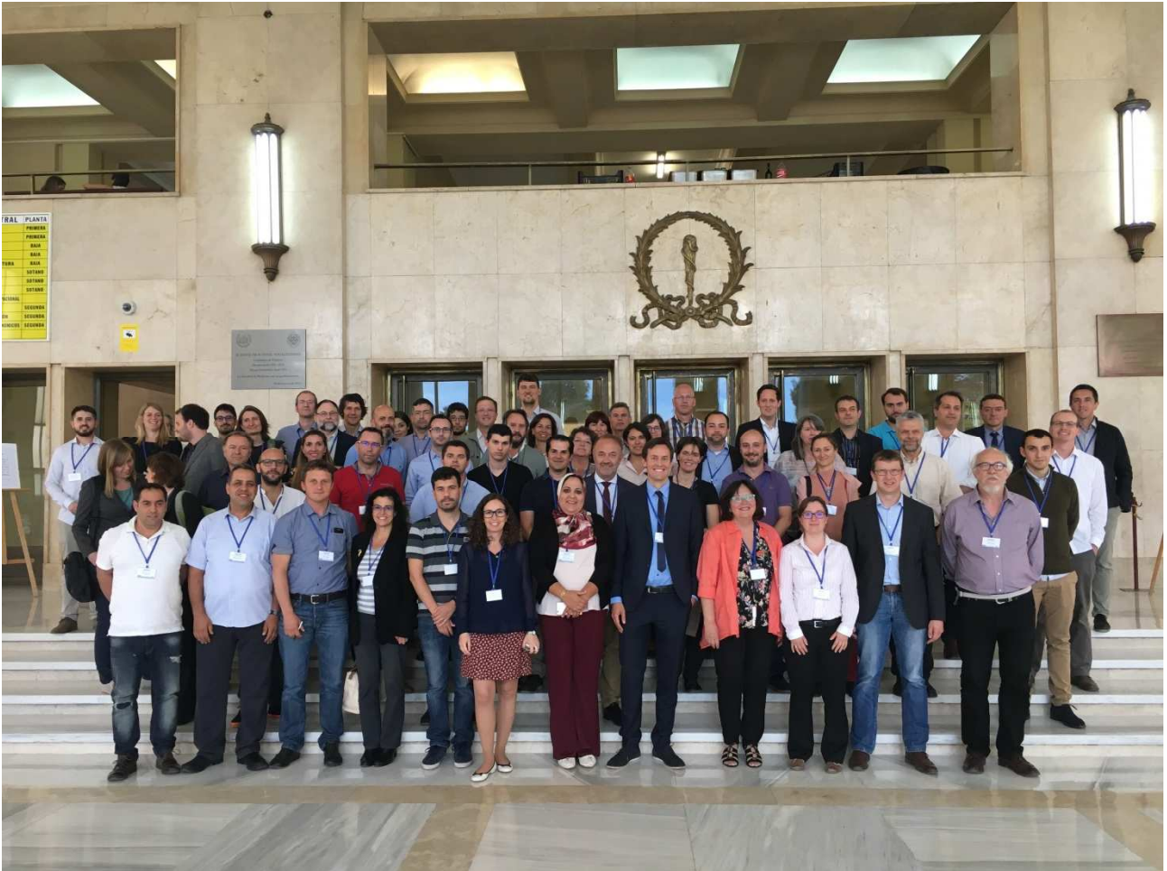
Group photo of the participants at the workshop.